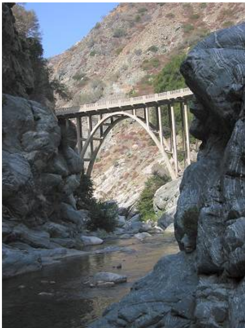
Bridge to Nowhere (San Gabriel River - East Fork)